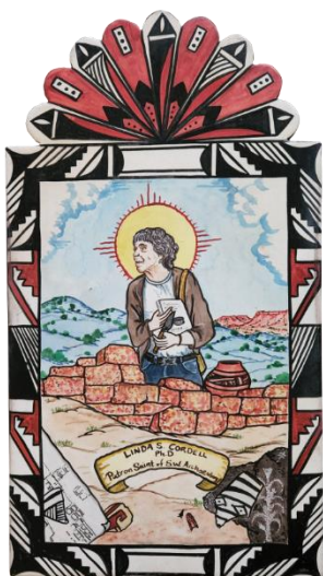
The Cordell Retablo by Charles Carrillo

The Cordell and Powers Prizes are awarded for the best two talks given at the Pecos Conference by archaeologists age 35 and under. The winners will receive $700 and be the annual stewards of the Cordell Retablo and the Powers "Pueblo Gothic" tile. Presentations are judged on intellectual merit, significance of the subject matter, professionalism, organization, and delivery. Rules and judging criteria are on pages two and three!